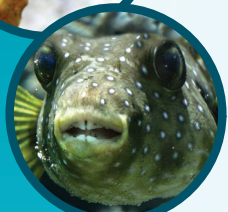
..... Stripebelly (h) Pufferfish

(8) Uses its whiskers for finding brittlestars to eat.