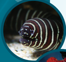
..... Zebra (a) Moray Eel

(1) Scrapes food from rocks with strong front teeth.