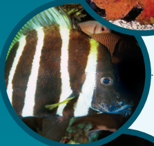
..... Bearded (c) Armorhead

(2) Spits water at insects to knock them out of trees.