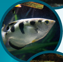
..... Archerfish (e)

(4) Slurps up small shrimp with a long snout.