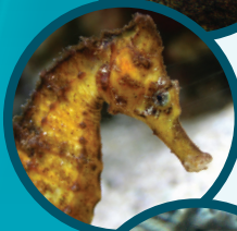
..... Seahorse (g)

(6) Catches slippery fish with its sharp pointed teeth.