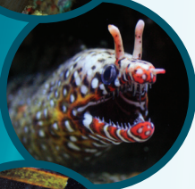
..... Dragon (d) Moray Eel

(3) Uses whisker-like barbels to find food.