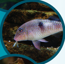
..... Goatfish (f)

(6) Catches slippery fish with its sharp pointed teeth.